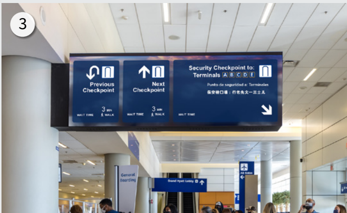
While choosing security checkpoints