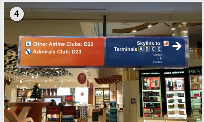
During recomposure & wayfinding to gates

Synect's Passenger360® digital signage platform was selected by DFW as a content management system (CMS) and previously implemented at the airport's Terminal D Extension.