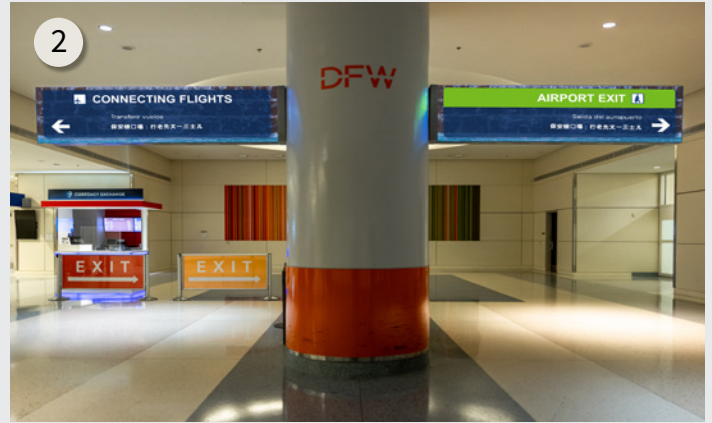
When leaving CBP and heading to connecting flights or the airport exit