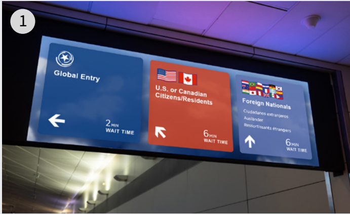
As arriving passengers head towards Customs and Border Protection (CBP)

In collaboration with DFW's customer experience team, Synect defined custom content and visual messaging to help passengers at four decision points.